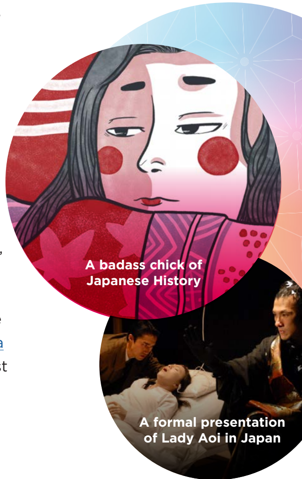
A badass chick of Japanese History